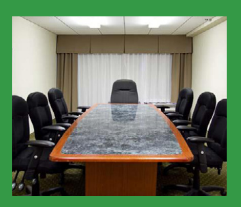
LYONS BOARDROOM CAPACITY 288 sq. ft., 12'x24 with an 8 ft. ceiling

Conference: 16 Semi-Rounds: 29 Banquet Rounds: 22